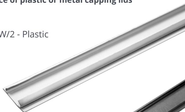
APCW/2 - Plastic