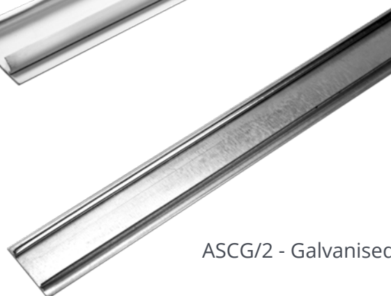
ASCG/2 - Galvanised