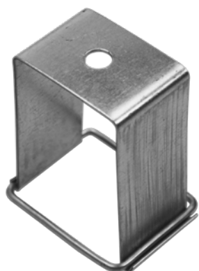
ASSB55/10 - Stirrup Hanger