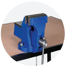
6" ENGINEERS' VICE