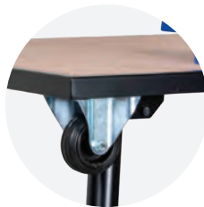
HANDLE AND WHEELS

NO DETACHABLE PARTS - STAYS TOGETHER AS ONE UNIT