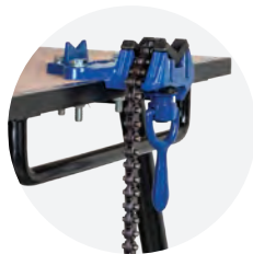
4" CHAIN VICE